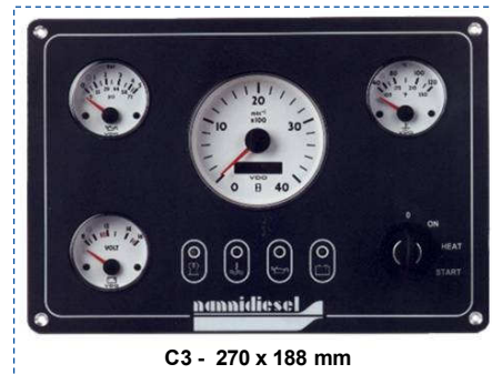
C3 - 270 x 188 mm